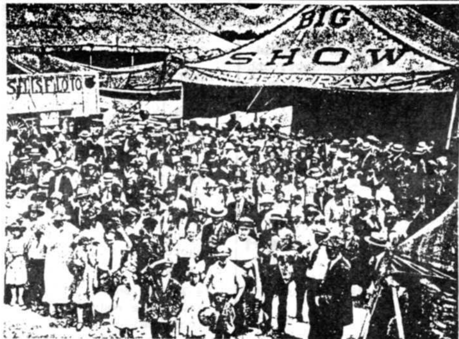
The above picture was taken in Denver, Colo., in August of 1925 when the Sells Floto Circus was playing in that city.