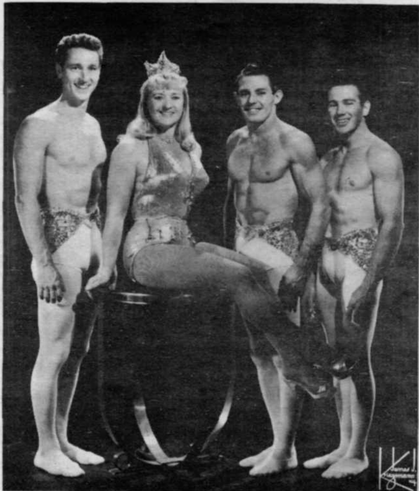
The Flying Alexanders