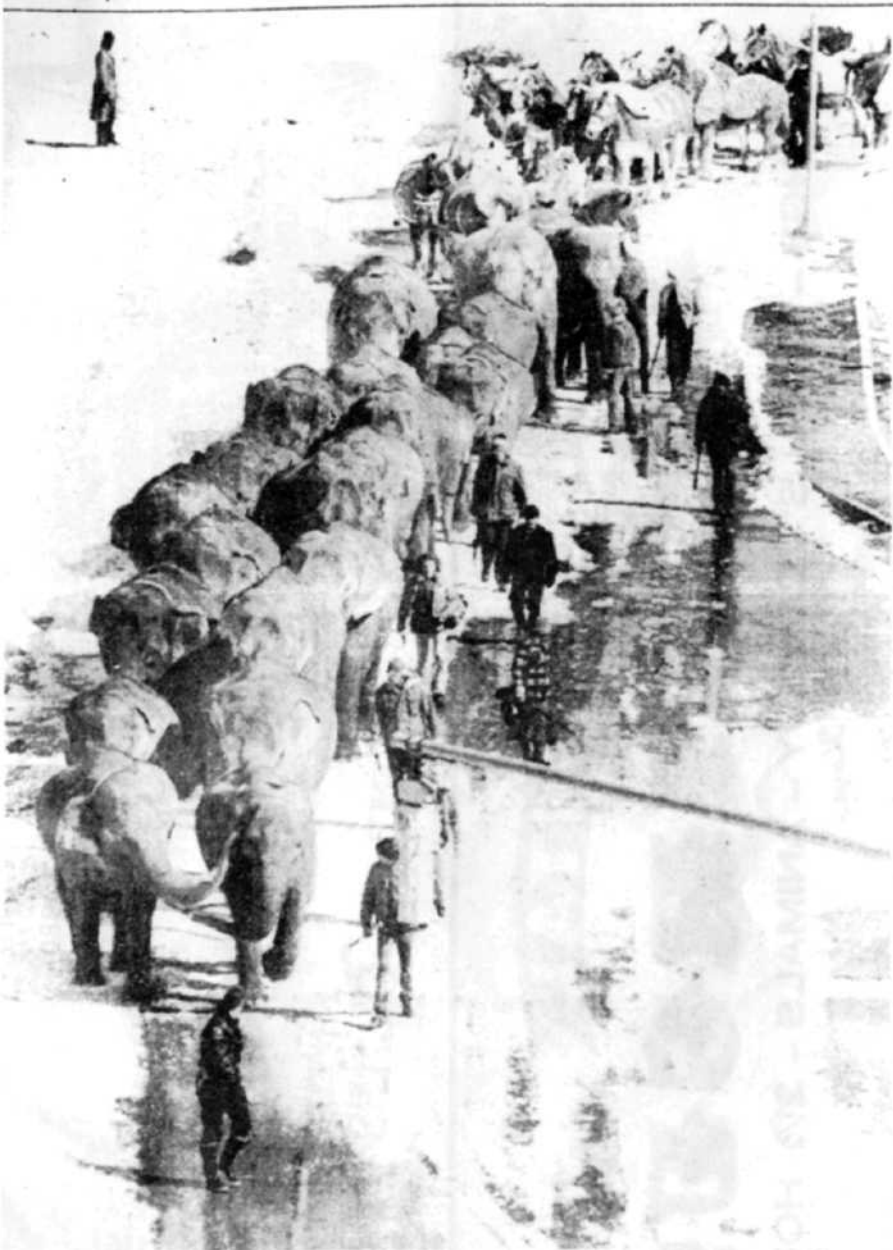
The Ringling-Barnum Blue Unit animals are shown here as they headed for the circus train after being snowed in for the night at Norfolk, Va. Both the circus and its patrons were stranded over night when a blizzard hit the area forcing them to stay inside the Scope Arena for the night.