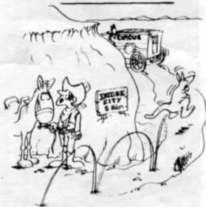
• "And I thought we had jackrabbits in Texas!"

The moon floated up in the sky and I lay wide-eyed watching the leaf patterns the moonlight made on the bed where it streamed in through the window.