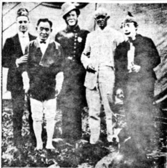
For names of the above see Page 4 of this special supplement.

The big side show has an air calliopo, wild man, snakes, Hondur