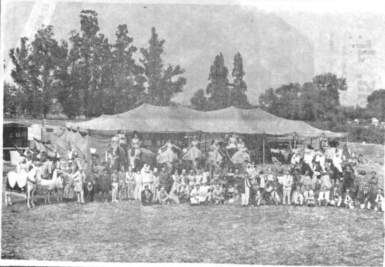
Clyde Beatty Circus personnel on a lot in Southern California. The picture was taken sometime in the late 1940's.