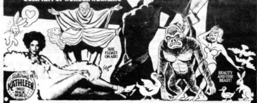
SHE FLIES ON AIR!