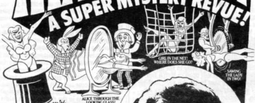
GIRL IN THE NET! WHERE DOES SHE GO?