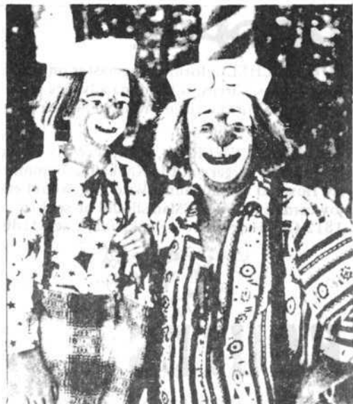
"LIKE FATHER . . . LIKE SON"