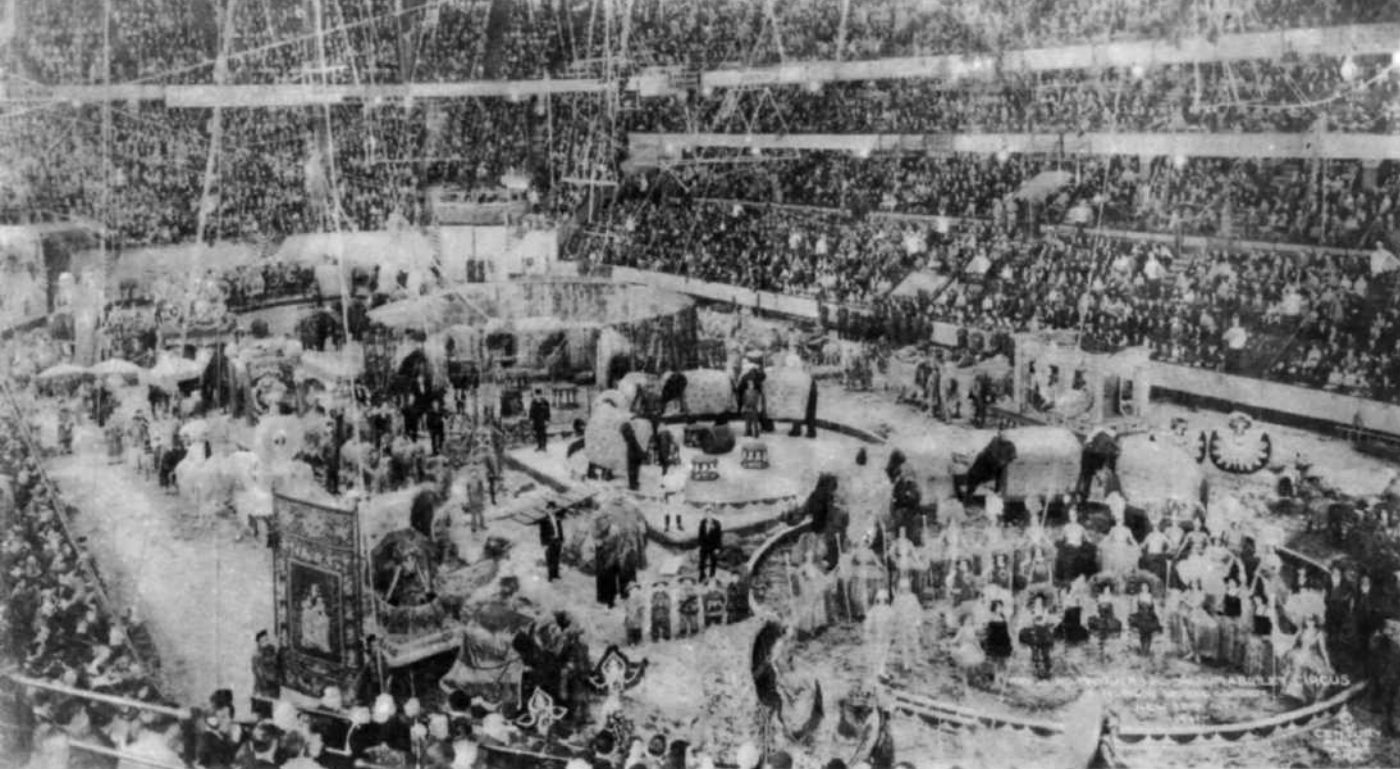
RINGLING BROS. - BARNUM & BAILEY CIRCUS at Madison Square Garden, New York City - 1931