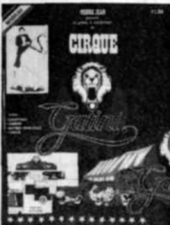
1978 - CUT OUT BOOK