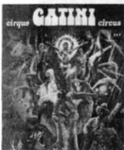
1977 - QUEBEC UNIT

IN 1977 FRENCH-CANADIANS WITNESSED THE RISE OF IT'S FIRST BIG TOP CIRCUS. THE FOLLOWING YEAR A SECOND UNIT WAS CREATED AND TOGETHER THEY COVERED HALF OF CANADA. IN 1979 THEY EXPANDED TO THE MANITOBA FRONTIER DOMINATING ALL OF THE EASTERN NATION.