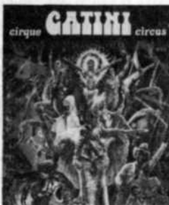
1978 - MARITIMES UNIT