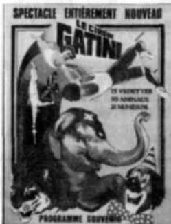
1979 - QUEBEC UNIT