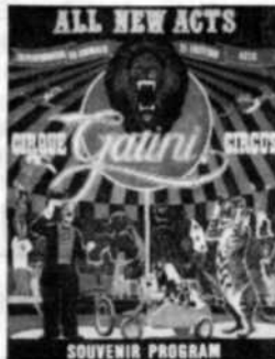
1979 MARITIMES UNIT