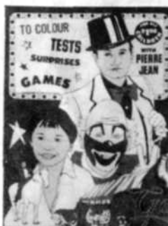
1979 - COLORING BOOK