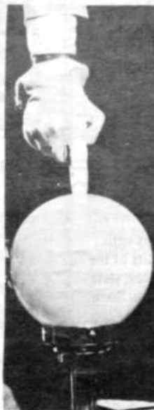
UNICYCLE BALANCING ACT