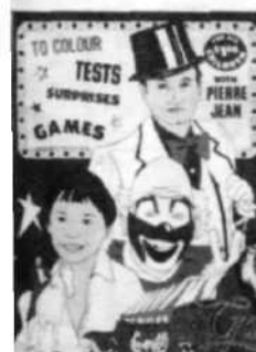
1979 - COLORING BOOK