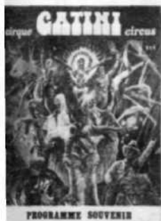
1977 - QUEBEC UNIT

IN 1977 FRENCH-CANADIANS WITNESSED THE RISE OF IT'S FIRST BIG TOP CIRCUS. THE FOLLOWING YEAR A SECOND UNIT WAS CREATED AND TOGETHER THEY COVERED HALF OF CANADA. IN 1979 THEY EXPANDED TO THE MANITOBA FRONTIER DOMINATING ALL OF THE EASTERN NATION.