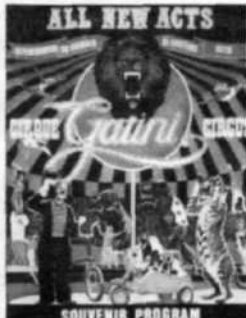
1979 MARITIMES UNIT