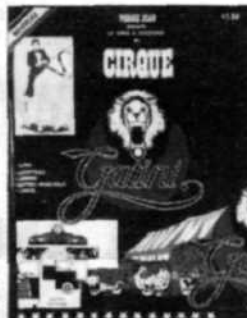
1978 - CUT OUT BOOK