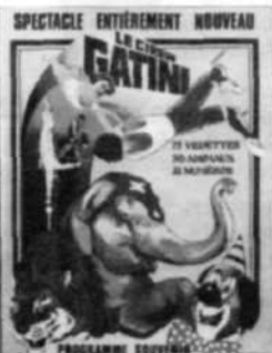
1979 - QUEBEC UNIT