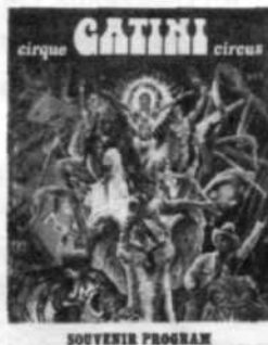
1978 - MARITIMES UNIT