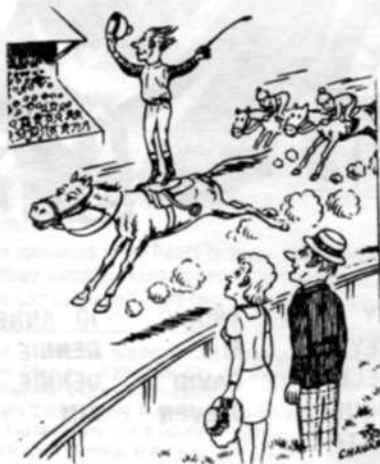
"He used to be a circus performer."