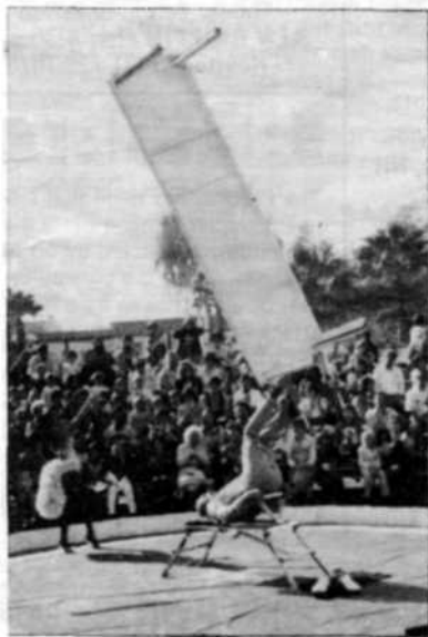
CHESTER CABLE Foot Juggler