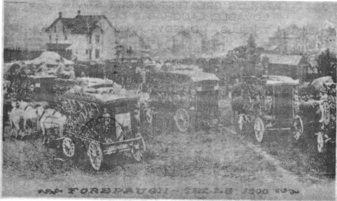
W. FORBAUGH - NEB. 1900