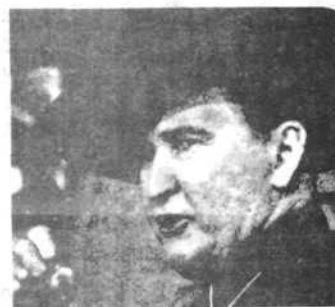
COL. TIM MCCOY