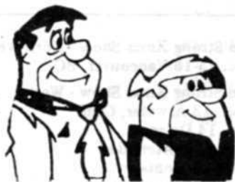
★ THE FLINTSTONES