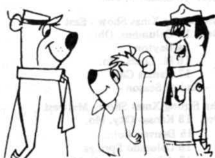
★ THE YOGI BEAR SHOW