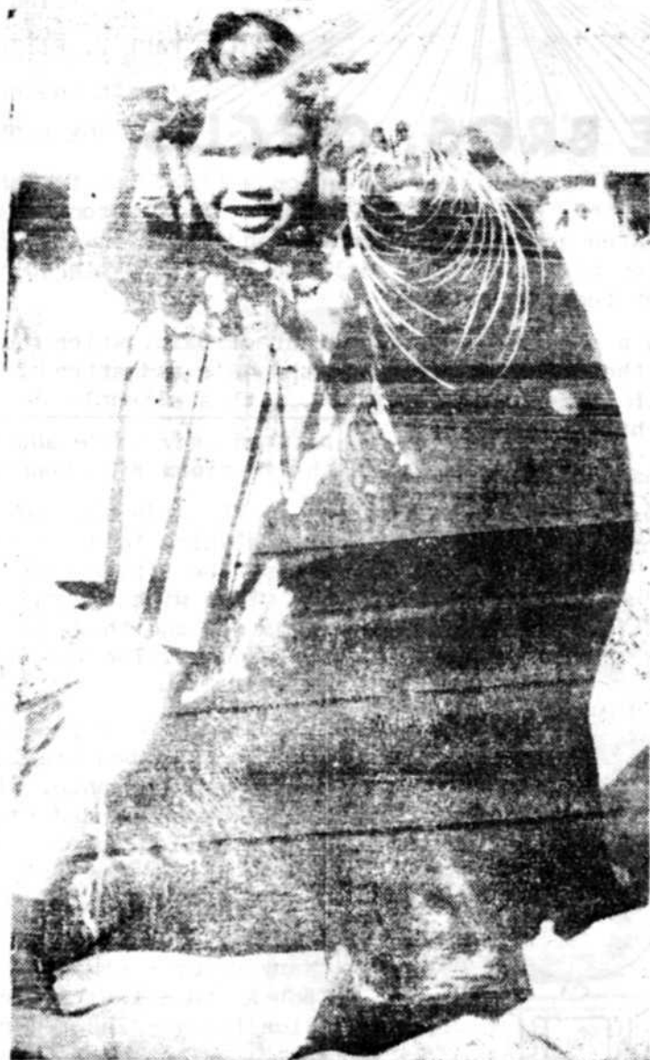
The above picture was taken on Russell Bros. Circus in 1942 for publicity purposes. With the little girl is the famous seal "Slicker" who appeared in each show program.