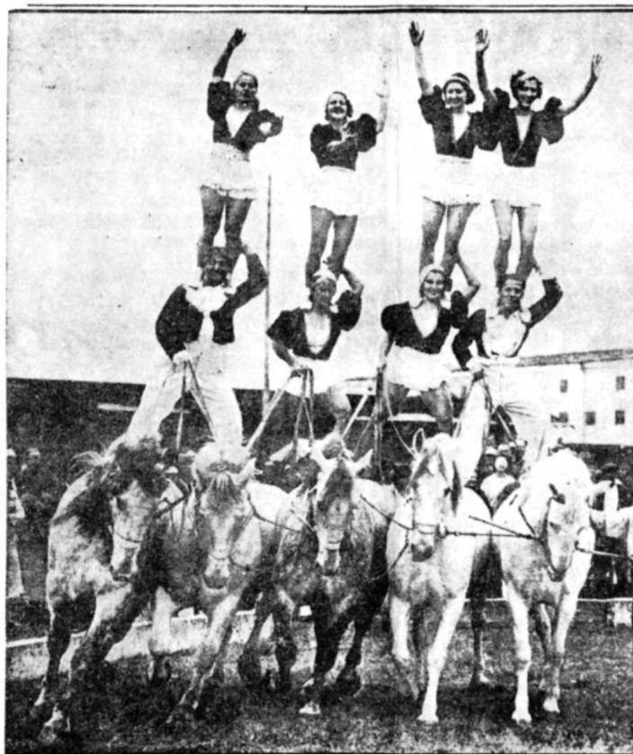
The Royal Repenski Troupe of bareback riders is shown above, while with the Ringling-Barnum Circus in 1937.