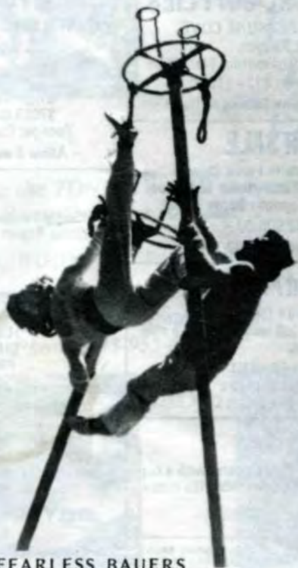
THE FABULOUS FEARLESS BAUERS