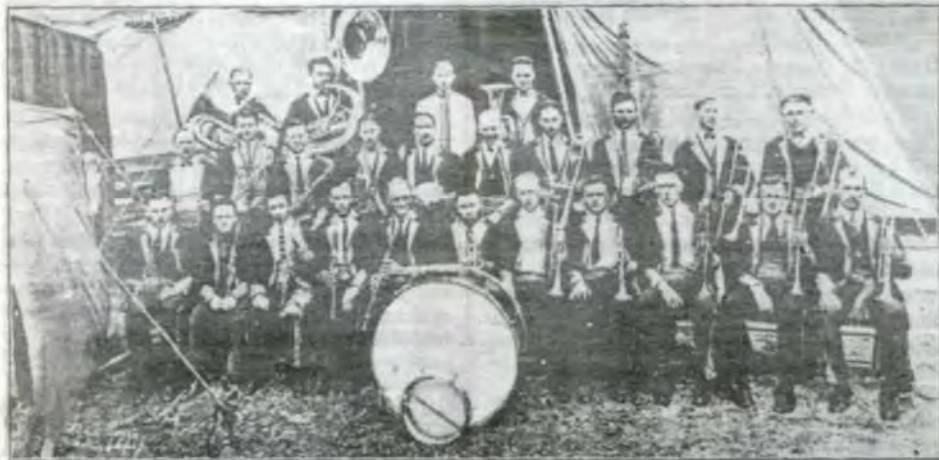
AL. G. BARNES CONCERT BAND — 1924