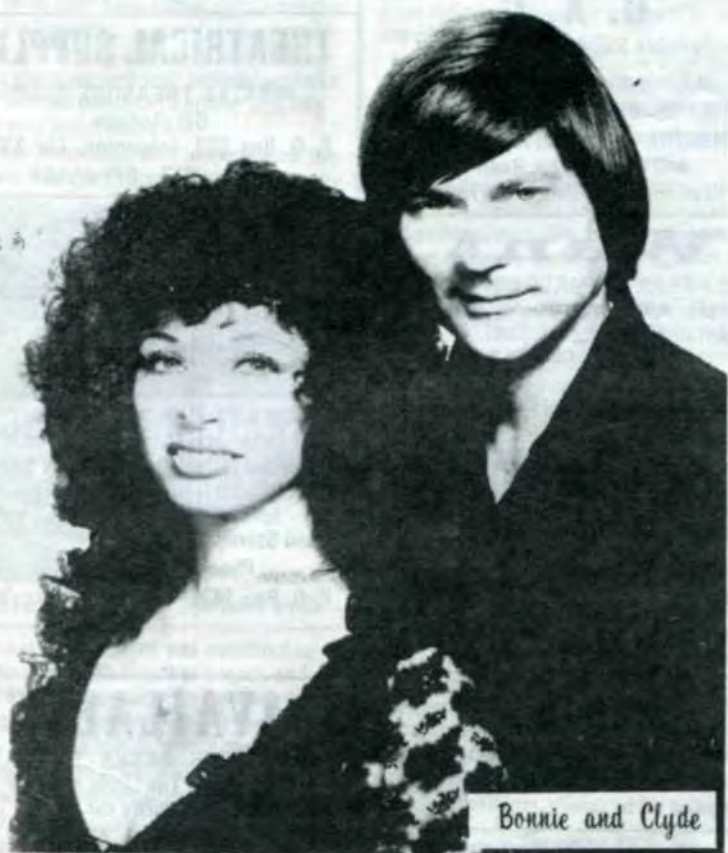
Bonnie and Clyde