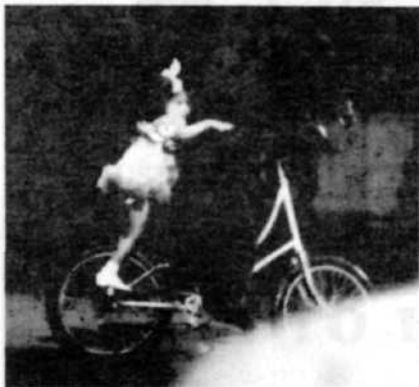
LITTLE MISS NAGHTIN takes a ride

Gunther's entrance with leopard atop the elephant was spectacular. The silver sequin-