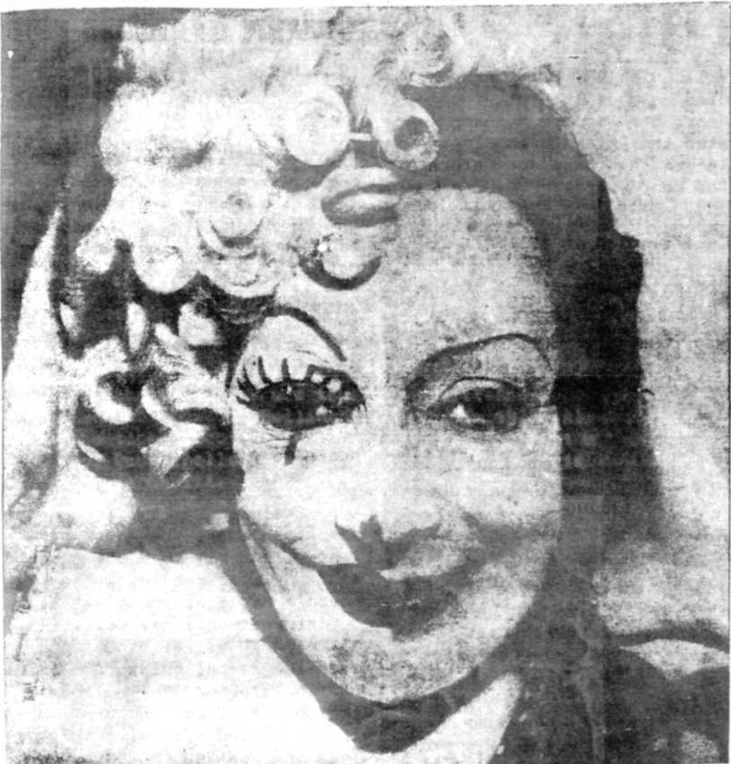
Pictured above is Lulu, the Woman Clown, who appeared with the Ringling-Barnum Circus in 1939. She was billed as the "World's Most Successful Women Clown" and the first woman clown to appear on the Ringling-Barnum Circus. (The above picture was made to show how she looks in everyday life and under the big top).