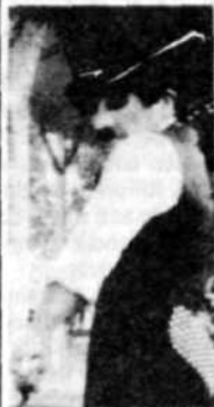
The Little Charlie Chaplin