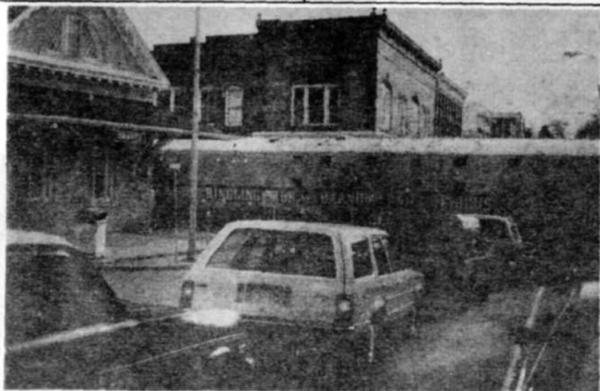
The Ringling-Barnum Circus train is shown here as it passed through Orange, Va., early this year. Traffic in both directions was stopped until the long train, carrying personnel, animals and equipment was cleared through the city.