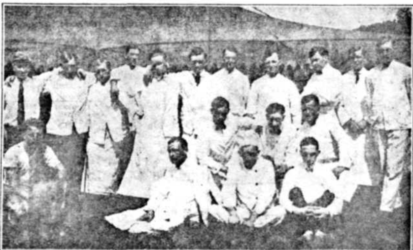
Dining crew of Hagenback-Wallace Circus. Photo was taken on June 25, 1915 at Clinton, Iowa.