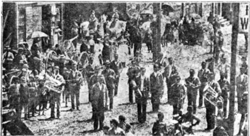
Walter L. Main Circus parade, at Tyrone, Pa. just after its May 30, 1893 wreck.