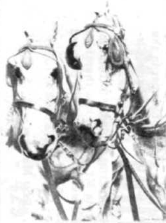
Print #2—Heavy Horse Series "Faithful Troupers"

Two Famous Ringling Percherons "Ned" and "Sailor" about 1935 Size 14" x 20" printed on 100 lb.