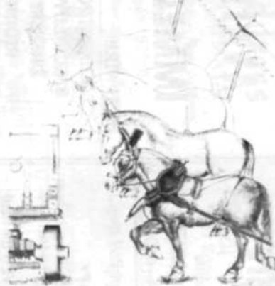
Print #3—Heavy Horse Series "Circus Horses"

From silhouette to finished detail A study of the Baggage Horse in Parade Harness