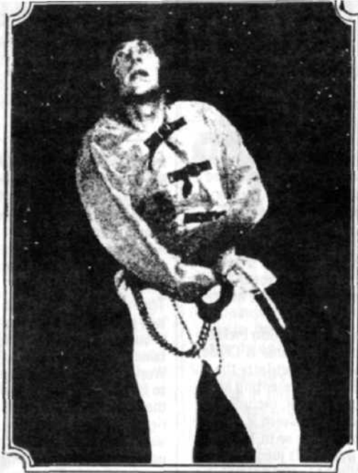
MANZINI LOCKED INTO A STRAIT JACKET