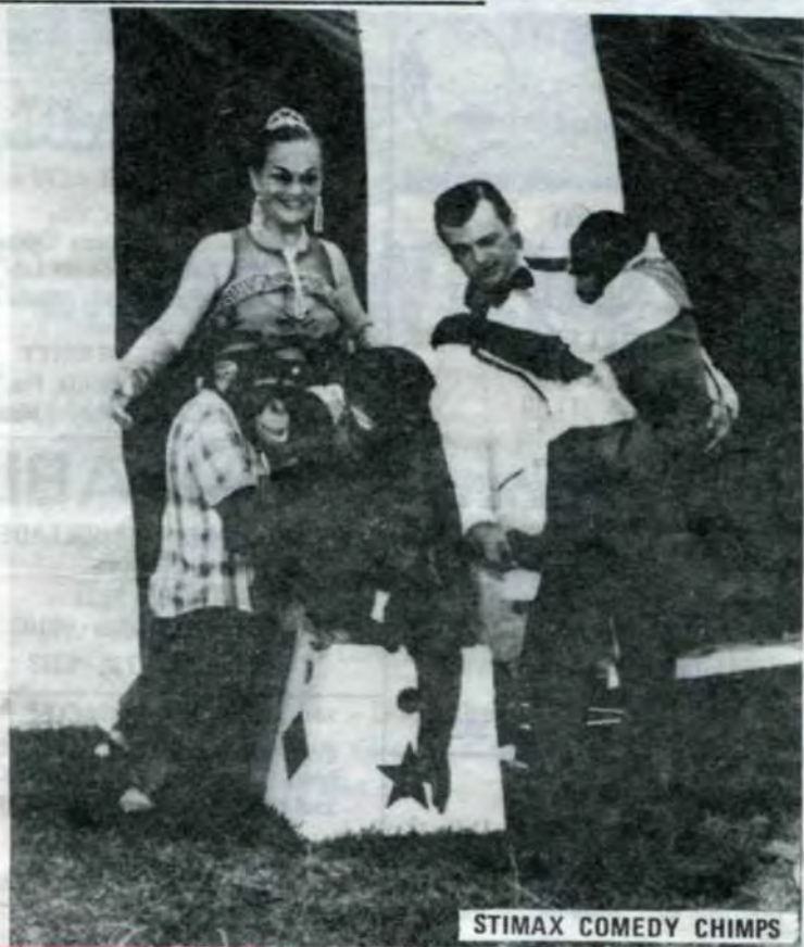
STIMAX COMEDY CHIMPS