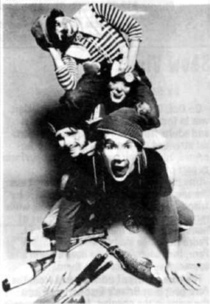
THE NO ELEPHANT CIRCUS