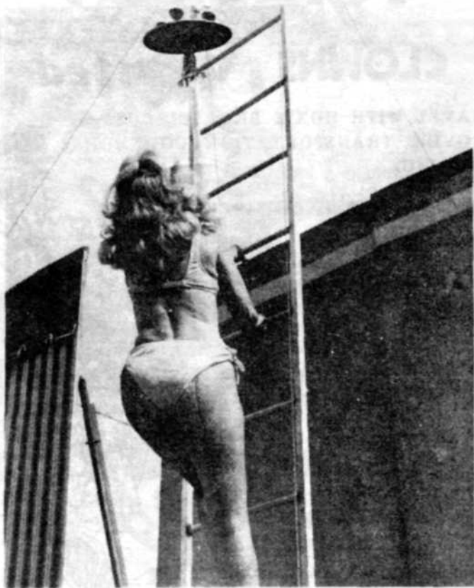
STIGETTE AND FIFI