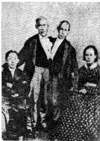
Chang & Eng

They grew to the height of five feet one inch for Chang and five feet two inches for Eng (Chang