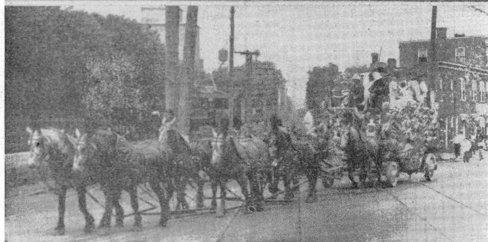
Bottom photograph shows the Lion and Mirror Bandwagon leading the street parade.