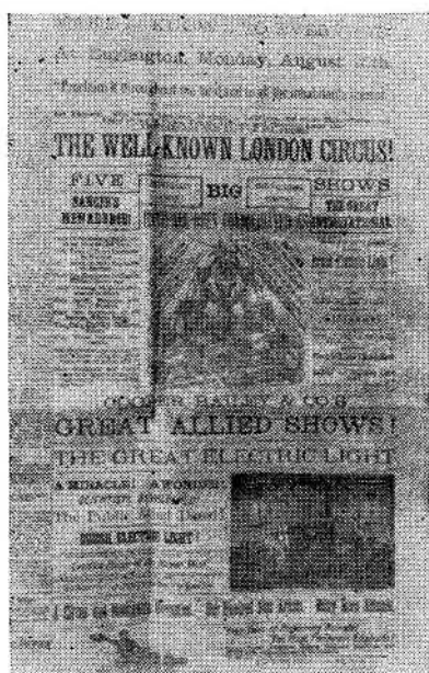
P. T. Took Count of Ten

This equipment actually cost Next Page, Please