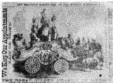
above "illustration from 1882 Courier"

At the same stand hoodlums took advantage of the activities at loading time, broke into one of the circus wagons and stole seven large glass globes with glass ships inside; a gross of china dolls in glass tubes; a 100-pound sack of pea-