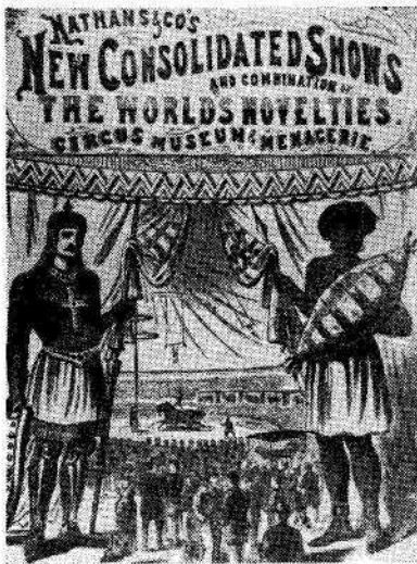
above "illustration from 1882 Courier"

Nathan & Co.'s Consolidated Shows united with Deckrill's French Circus. A far famed menagerie—a famous featured museum and an all-conquering double circus alliance in one big ring. Presenting an exceptional programme of refreshing originality portrayed by an assemblage of artists whose equal do not exist.