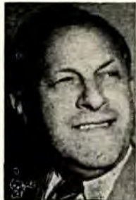
"OUR OPEN LETTER"

Now that a majority of the tented shows have officially opened for the '51 season, we take this opportunity to suggest to owners of riding devices who have neglected or overlooked the importance of having their various rides carefully checked and inspected by expert riding device mechanics, should do so at once.