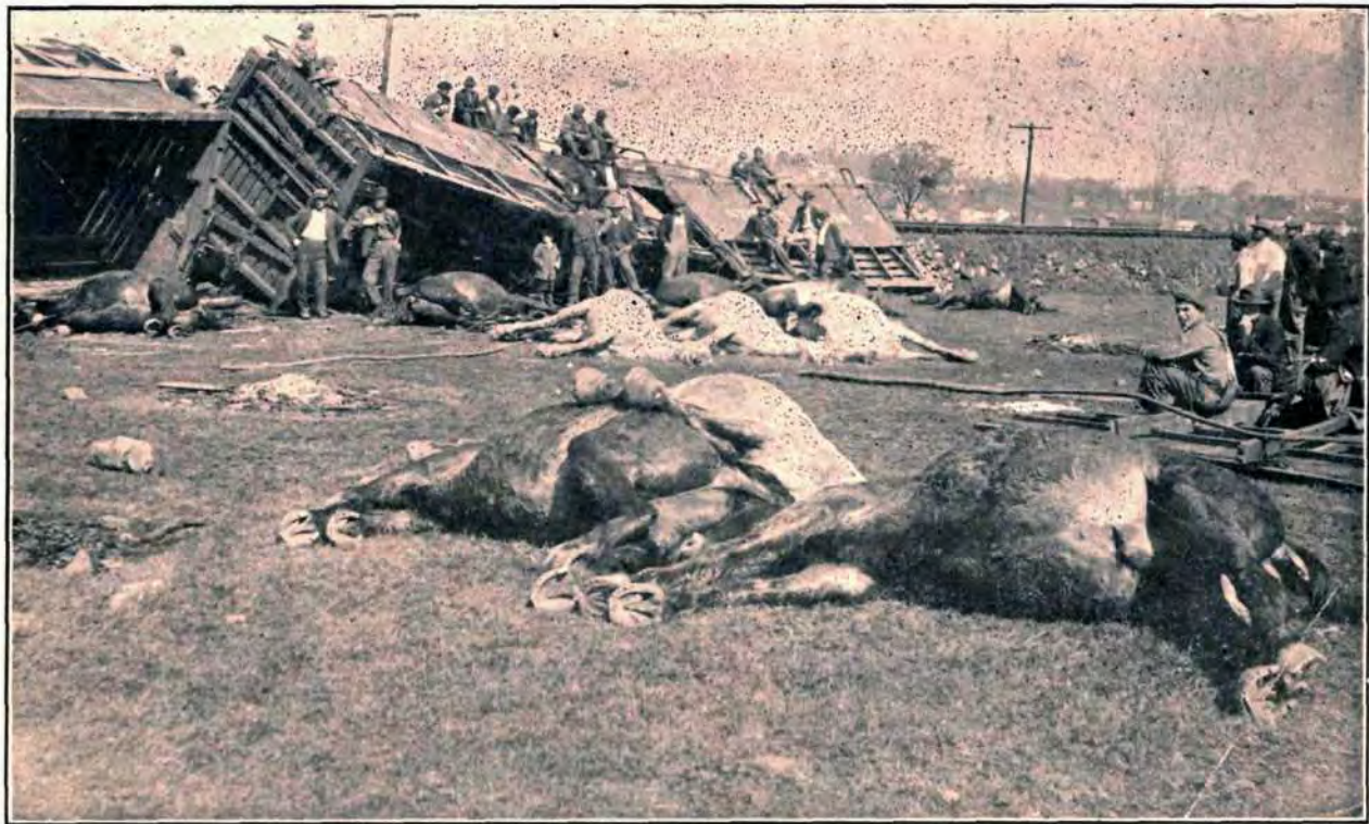
WRECK AT FRONT ROYAL, VA., APRIL 20, 1920