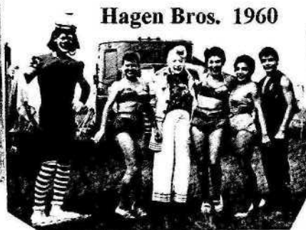
Hagen Bros. 1960