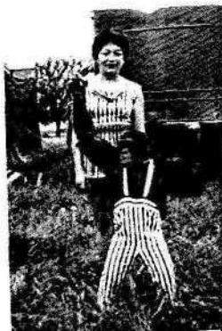
King Bros. 1960