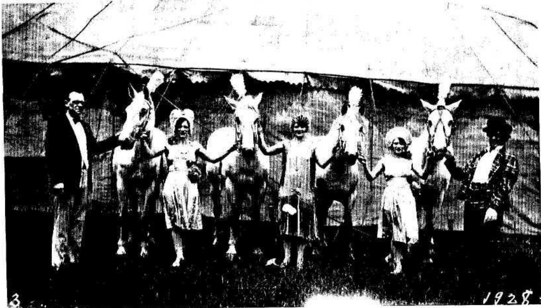
HOLLIS-MEGEE SPARKS 1928