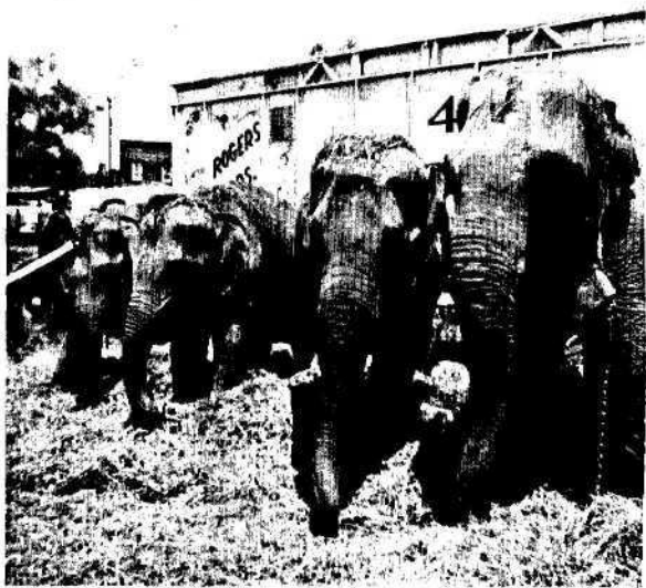
ROGERS BROS 1950