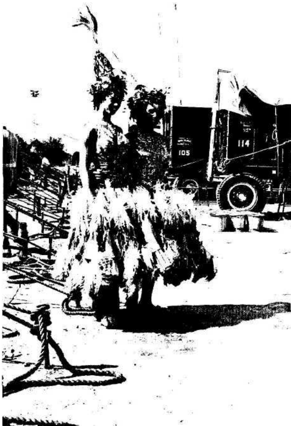
ILONKA + EGY KAROLY