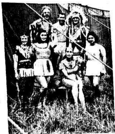
MILLS BROS. CIRCUS