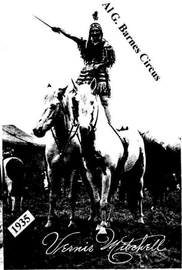
Al G. Barnes Circus