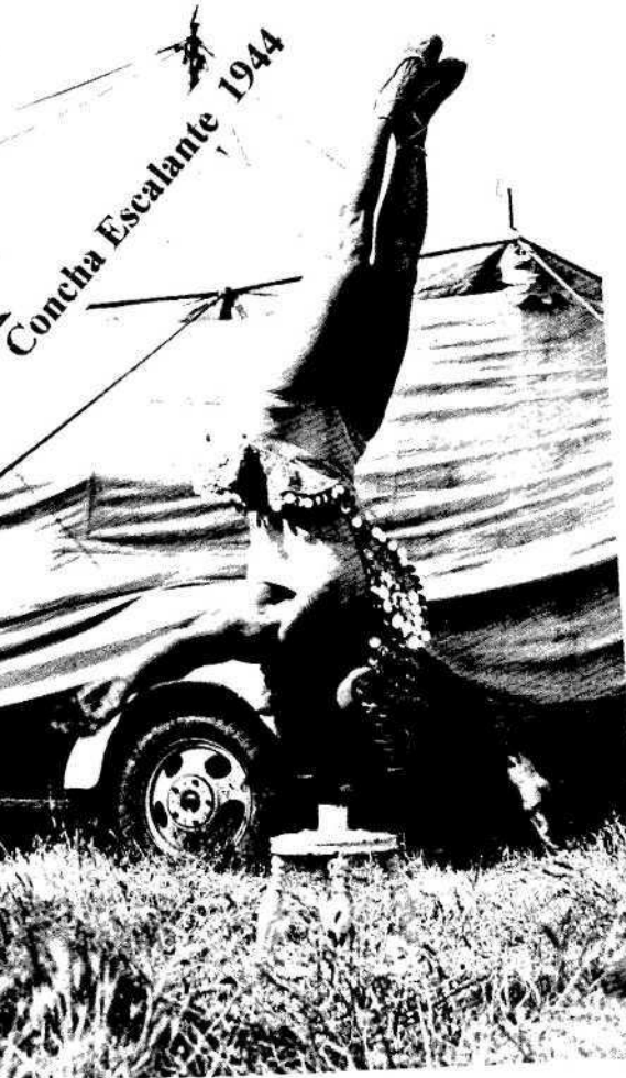
Concha Escalante 1944