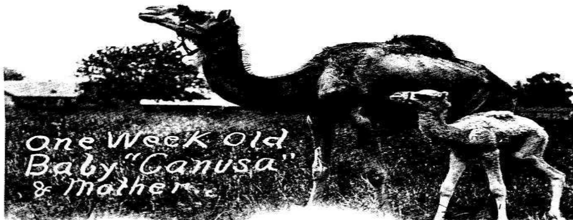
One Week Old Baby "Ganusa" & Mother